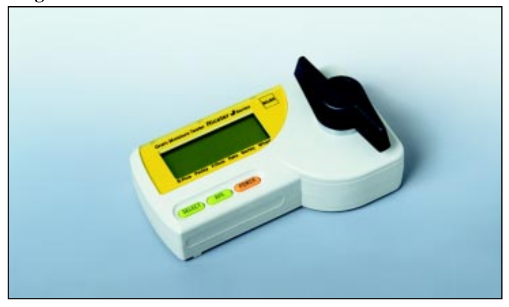
The Standard - The World's Largest Selling Pocket-sized Grain Tester

The culmination of many years of field experience are apparent. Dual temperature compensation for both the grain and the instrument, self-checking capability to determine machine calibration, and statistical averaging provide unsurpassed measurement accuracy and reliability. The Riceter will display the content of up to nine consecutive samples as well as the average of the samples. Standard systems will test wheat, barley, oats and rice. Special models are available with other calibrations.